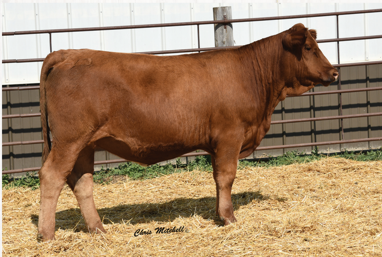
DCH HILLE H835 Sells as Lot 22.