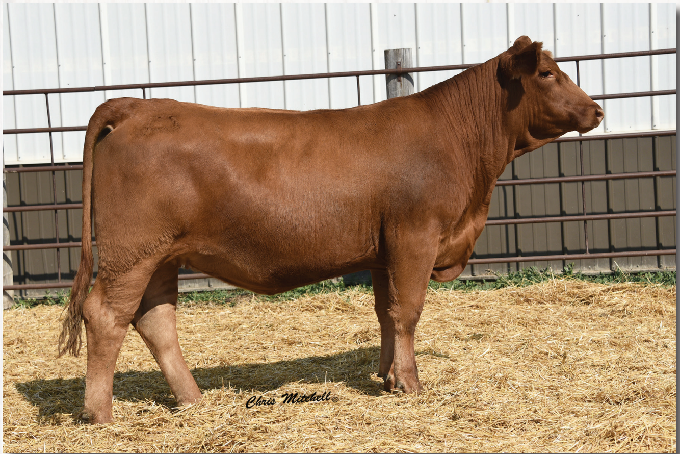
DCH HILLE H804 Sells as Lot 6.