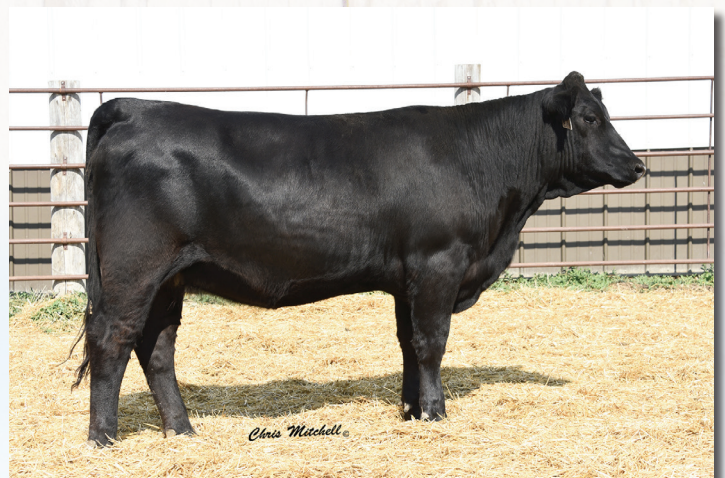
DCH HILLE H913 Sells as Lot 5.

One of those special ones that get the second look. A dam of smerit mother and maternal grand dam. Maternal great grand dam has achieved dam of distinction status. The Choco daughter she carries should be special.