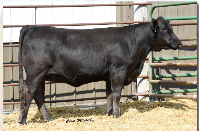
DCH HILLE H945 Sells as Lot 18.

An exceptional female from a first calf Artemis heifer. A good clean well built female with a great future ahead of her. A standout from a young cow